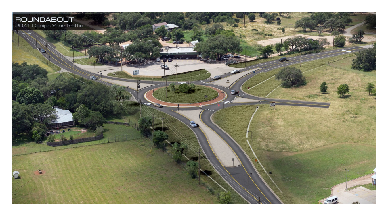
Visualization of completed roundabout at RM 3237 and RM 150 that was constructed summer 2022.

There are 9 different roundabouts planned in the Driftwood and Dripping Springs area.