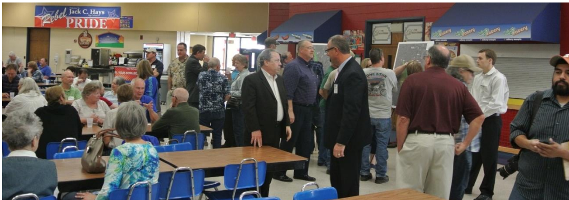
FM 150 Alignment Public Meeting – April 14, 2015

Published Notification in the Hays Free Press