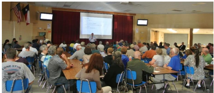
Presentation at Hays High School – April 14, 2015

Location: Hays High School Cafeteria 4800 Jack C. Hays Trail Buda, Texas 78610